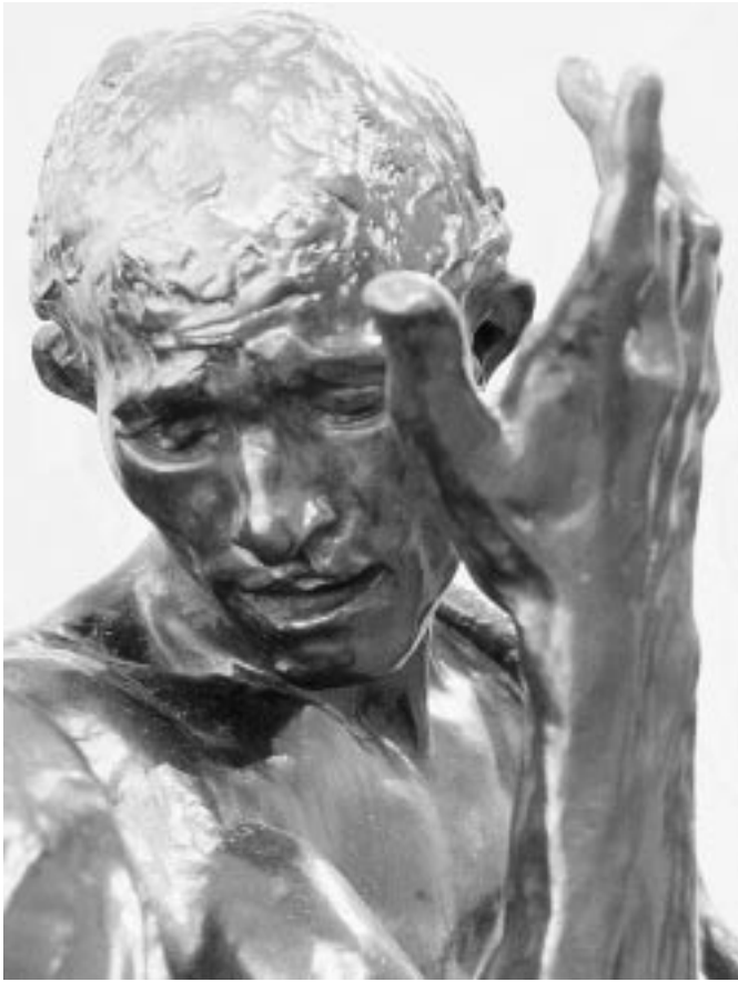
PIERRE DE WIESSANT