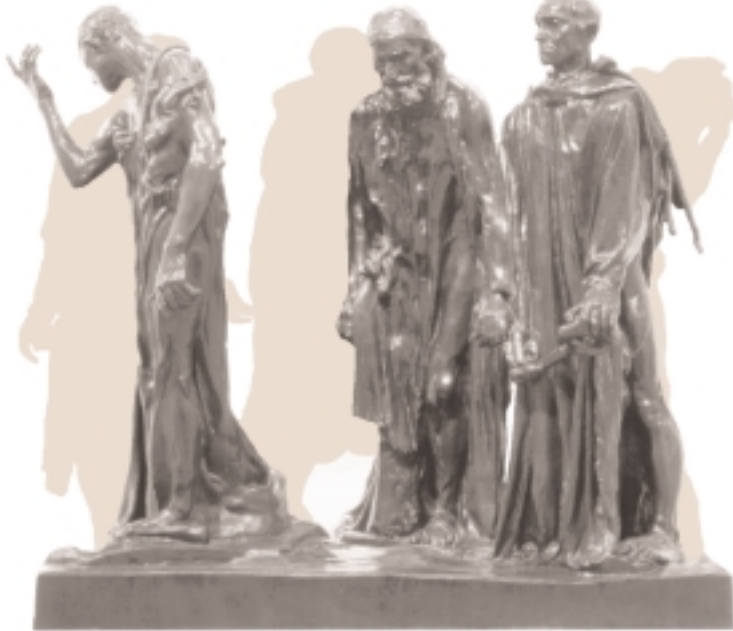
Eustache de Saint-Pierre