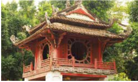
Temple of Literature, Hanoi