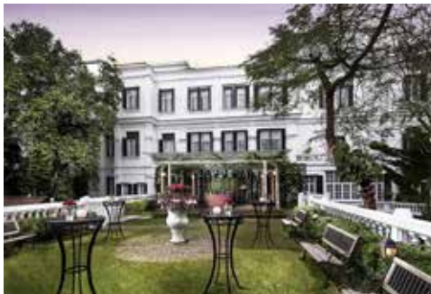
Sofitel Legend Metropole, Hanoi

Park Hyatt Siem Reap features 104 rooms that ensure the comforts of the modern world in an ancient land.