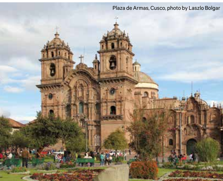
Plaza de Armas, Cusco

This itinerary is subject to change at the discretion of The Metropolitan Museum of Art and Arrangements Abroad. For complete details, please carefully read the terms and conditions at www.arrangementsabroad.com/terms .