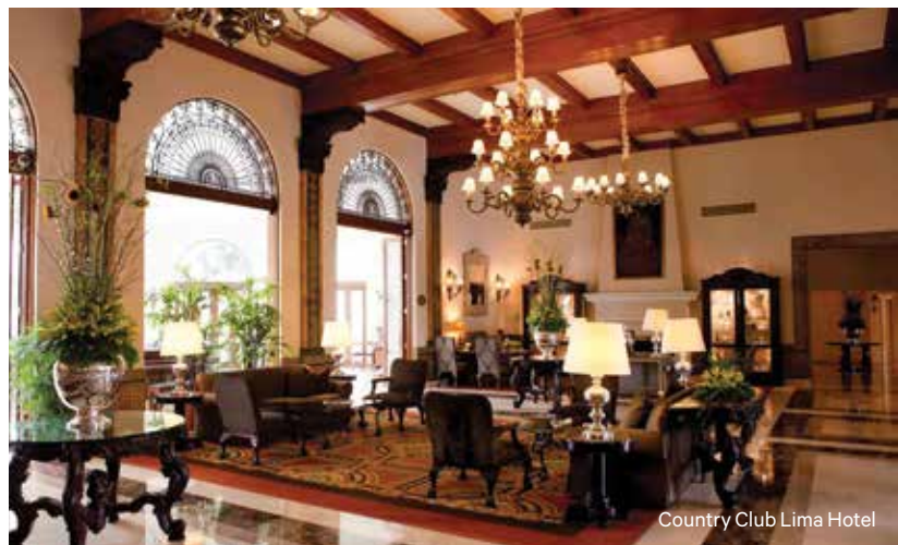
Country Club Lima Hotel

Located in the upscale San Isidro district, the Country Club Lima Hotel was built in 1927 and is a Peruvian Cultural Monument. The hotel offers a blend of architectural charm, history, and modern comfort. Elegant rooms and suites—decorated with a mix of classical and Peruvian artwork—have free Wi-Fi, flat-screen televisions, safes, and minibars. Amenities at the Country Club Lima Hotel include an award-winning Peruvian restaurant, a lobby bar, an English-style pub, a gym, a spa, and an outdoor pool. Guests may use the golf club across the street for an additional fee.