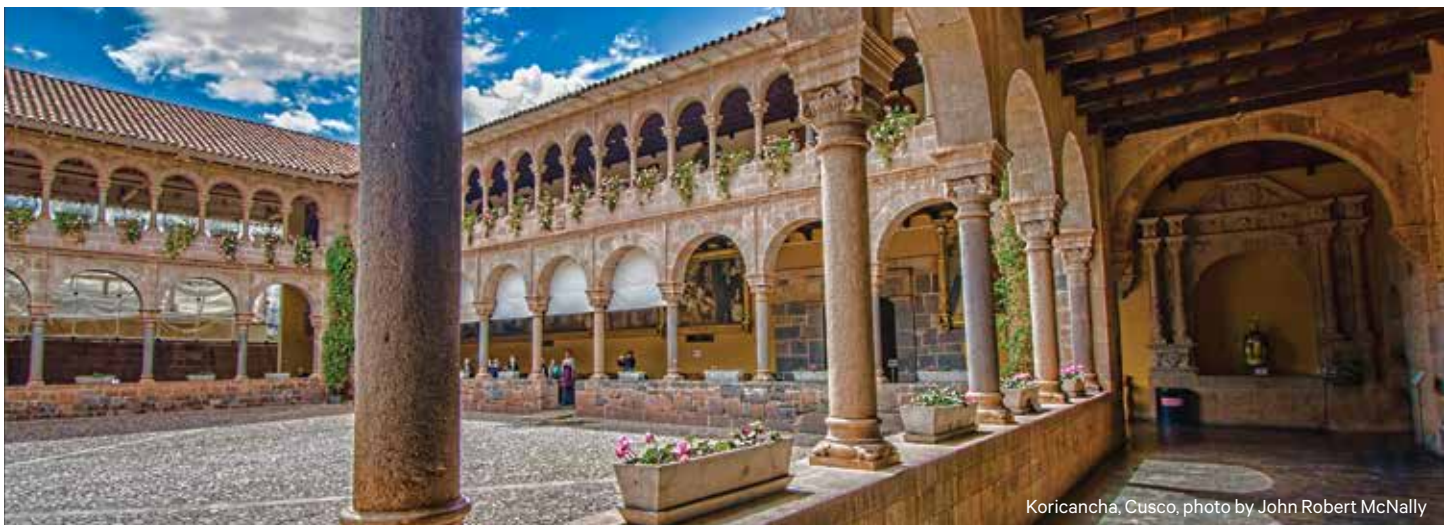
Koricancha, Cusco

Today we will have a full morning to explore the site. You may wish to rise early to hike the short distance to Inti Punku, the Incan "sun gate," to witness the sun rise through the mist over Machu Picchu.