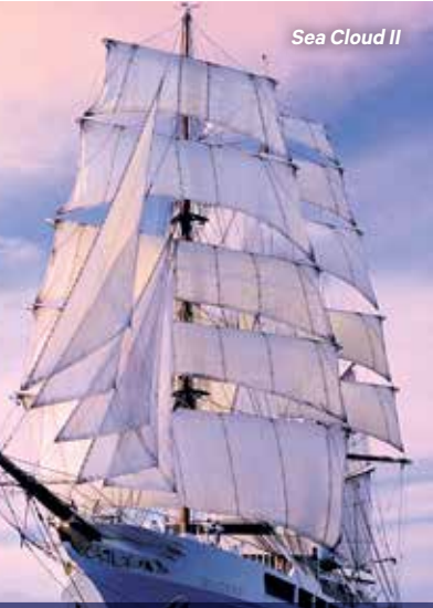
Sea Cloud II