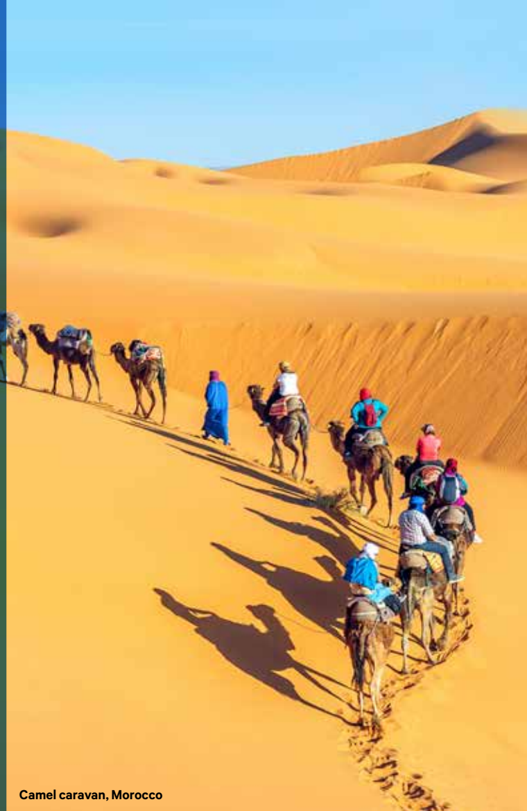
Camel caravan, Morocco