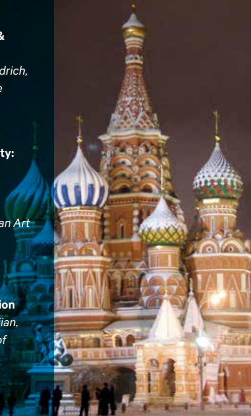
Saint Basil's Cathedral, Moscow

A New Year's Celebration With Stephan Wolohojian, Curator, Department of European Paintings December 27, 2018 – January 5, 2019