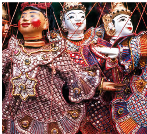
Traditional Thai Puppets

This morning a private barge takes us to a canal-side artist community to meet local craftsmen and performers and enjoy a traditional puppet show. Following lunch, see the Suan Pakkad Palace. As we stroll through the traditional teak houses gathered by a member of the Royal Family, enjoy the rich collection of lacquer and furniture. The evening is at leisure. B, L