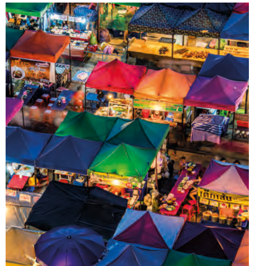
Spiderhunter, Singapore Botanic Gardens (top); and Bangkok Night Market Stalls (above)