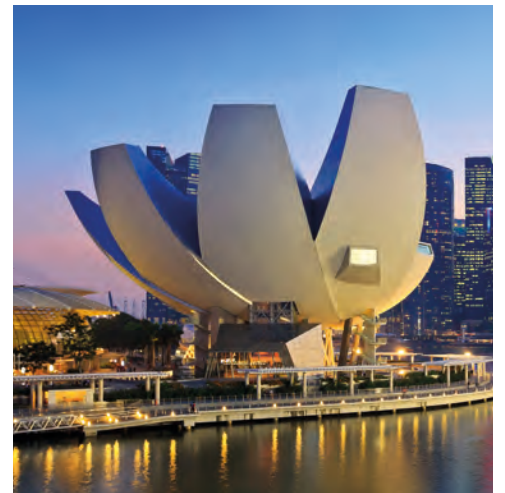
Photos clockwise from top right: Wat Phra Kaew Temple (detail), Bangkok; Map of the Malay Region; The ArtScience Museum by Moshe Safdie, Singapore; Gardens by the Bay, Singapore. The Wat Phra Kaew Temple, Bangkok; and Thai Countryside. Front cover: Buddhas at Wat Arun, Bangkok. Back cover: Eastern & Oriental Express (top) and Grand Palace detail, Bangkok (bottom).