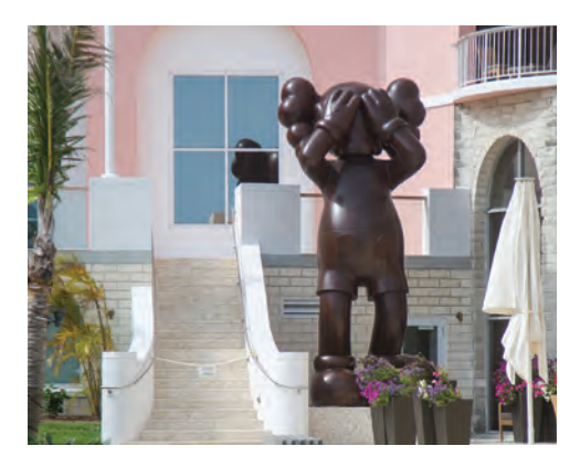
At This Time sculpture by artist Kaw at the Hamilton Princess Hotel & Beach Club