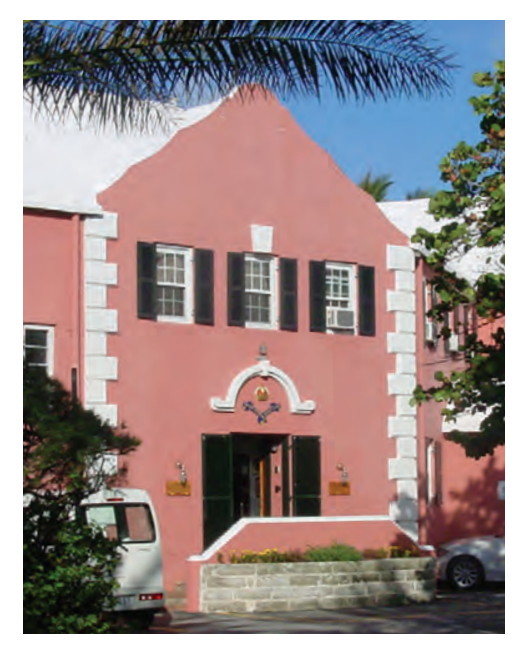
Royal Bermuda Yacht Club