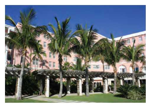
The Hamilton Princess Hotel & Beach Club