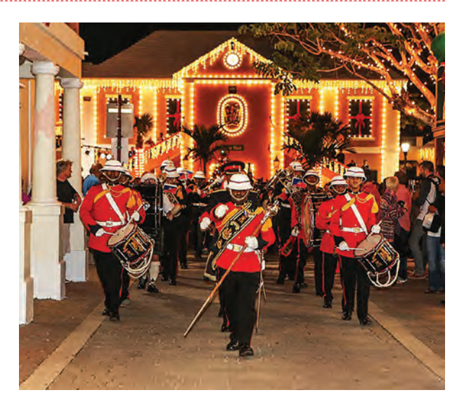
The Bermuda National Trust Christmas Walkabout