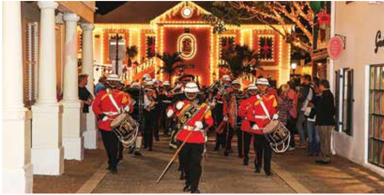
Bermuda National Trust Christmas Walkabout