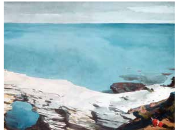
Natural Bridge, Bermuda , ca. 1901. Winslow Homer (American, Boston, Massachusetts 1836–1910 Prouts Neck, Maine). Watercolor and graphite on white wove paper. The Metropolitan Museum of Art, Amelia B. Lazarus Fund, 1910 [10.228.12]