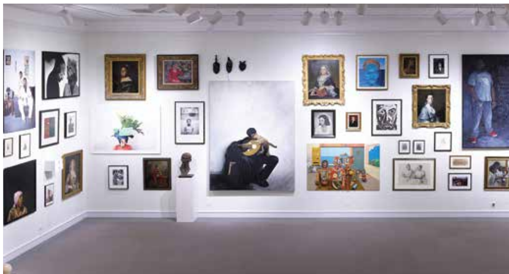
Bermuda National Gallery