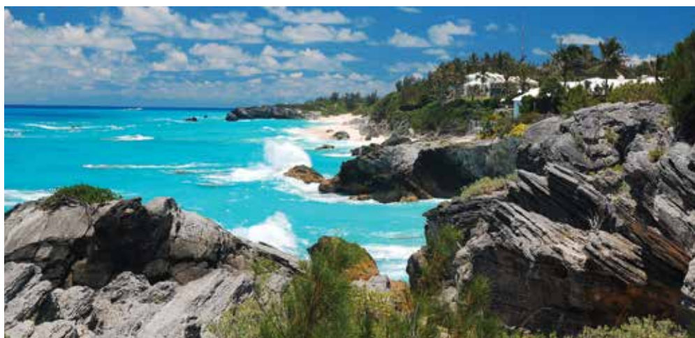
Bermuda South Shore

This itinerary is subject to change at the discretion of The Metropolitan Museum of Art and Arrangements Abroad. For complete details, please carefully read the terms and conditions at www.arrangementsabroad.com/terms .