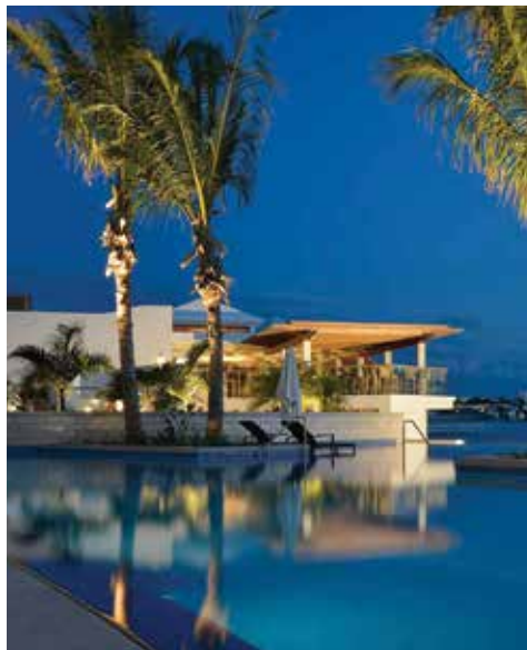
Hamilton Princess & Beach Club pool