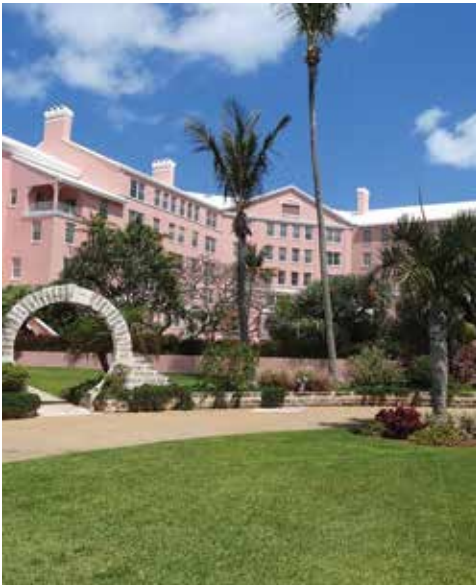
Hamilton Princess & Beach Club

Hamilton Princess & Beach Club is a luxury urban resort, overlooking the stunning blue waters of a breathtaking harbor.