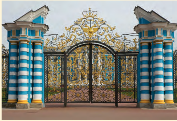
Catherine's Palace gates, St. Petersburg.