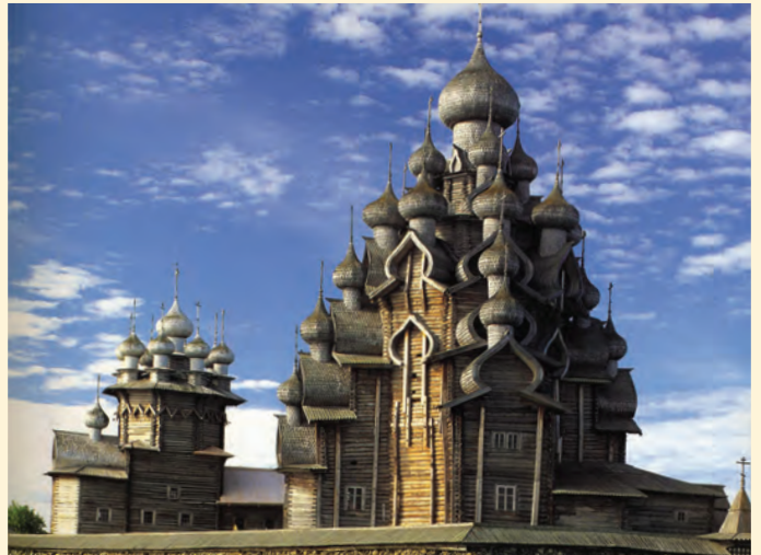
Kizhy Island, Lake Onega.

Attend morning lectures and learn to prepare blinis and pelmenis during a Russian cooking class. In the afternoon explore the picturesque island of Kizhy, a UNESCO World Heritage Site on Lake Onega. The open-air Museum of Architecture includes the Church of the Transfiguration, an onion-domed masterpiece built without a single metal nail, resembling something out of a Russian fairytale.