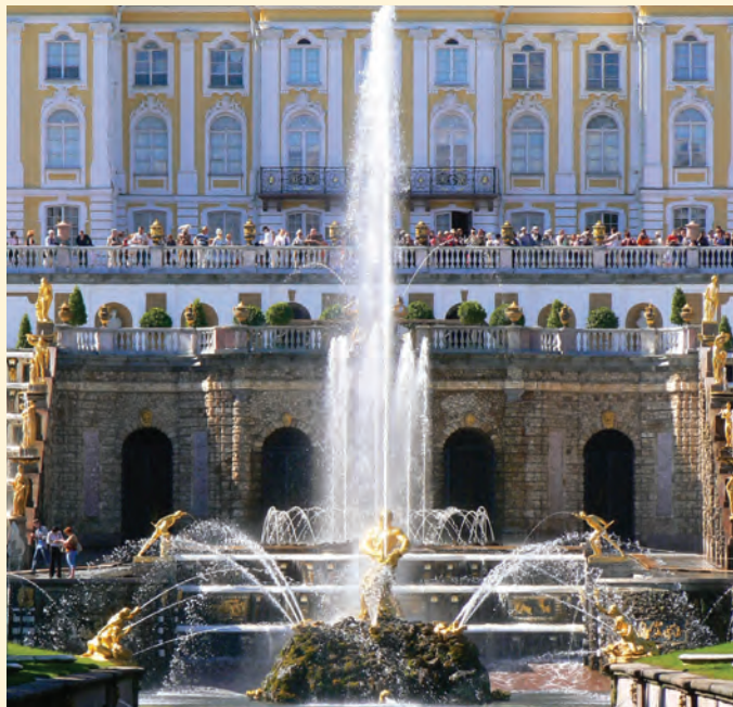
The Grand Cascade, Peterhof.

ST. PETERSBURG POSTLUDE $2,675 per person. Single supplement $595. Includes three nights accommodations at Grand Hotel Europe; breakfast daily, two lunches and one dinner; sightseeing as noted; performance at Mariinsky Theater. Single supplement includes a double room for single use.