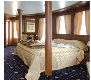
Dining room (left) and owner's suite (right) aboard M.S. Volga Dream .