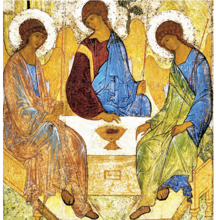
The Old Testament Trinity by Andrei Rublev, Old Tretyakov Gallery.

Upon arrival in Moscow, transfer to the deluxe Ritz-Carlton Hotel in the historic city center. In the late afternoon, enjoy a walking tour of Red Square with its landmark Saint Basil's Cathedral, Lenin's Tomb, and GUM department store, facing the red brick towers and golden cupolas of the Kremlin. Gather this evening for a welcome reception and dinner at the hotel.