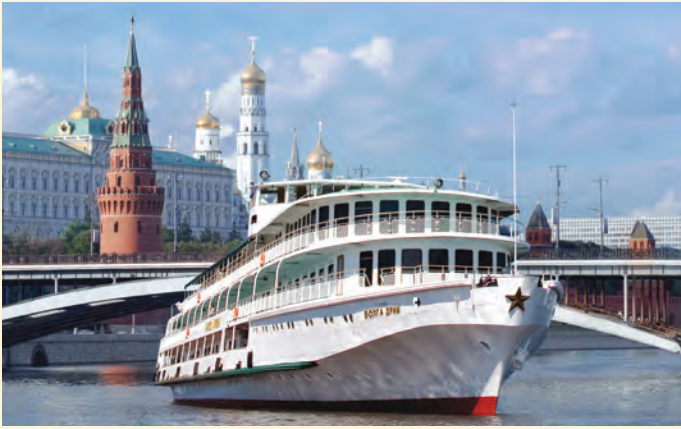
M.S. Volga Dream in Moscow.