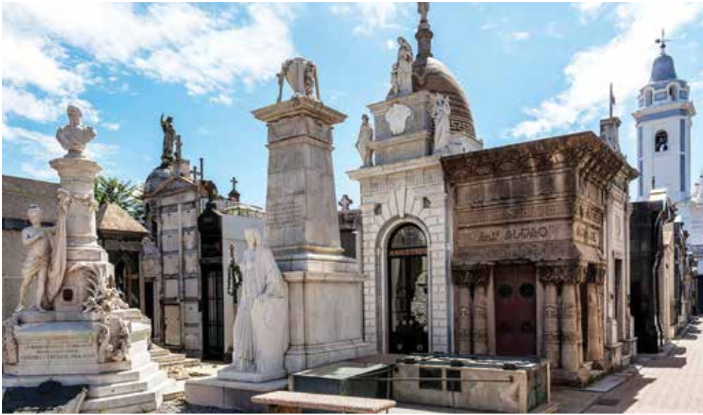
Recoleta Cemetery