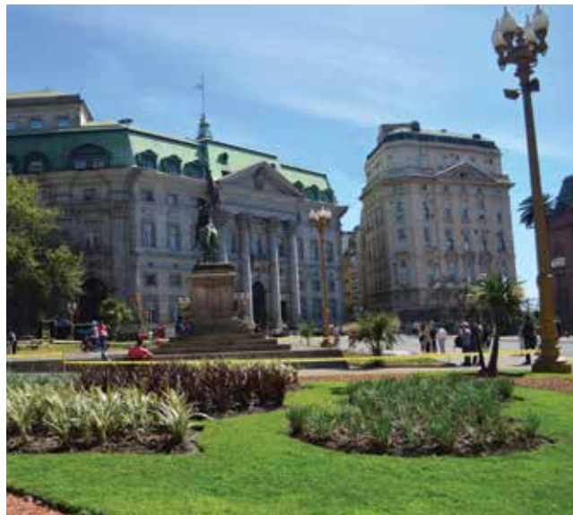
Banco de la Nación