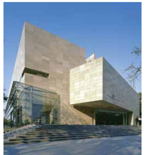
Photos clockwise from top right: Recoleta Cemetery; Argentina , bakery card from the Flags series (D34), issued by the Ward-Mackey Company, early 20th century. Commercial color lithograph. The Metropolitan Museum of Art, The Jefferson R. Burdick Collection, Gift of Jefferson R. Burdick [Burdick 307, D34.2]; MALBA; Palacio Barolo interior, Carla Wosniak; Women's Bridge by Santiago Calatrava; Faena Art Center. Front cover: Barrio of La Boca. Back cover: Buenos Aires (top); Bodegas Salentein Winery (bottom).