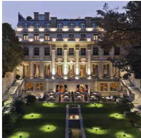
Palacio Duhau-Park Hyatt

Park Hyatt Mendoza, with its beautifully restored 19th-century Spanish colonial façade, is situated in the center of Mendoza, close to the most important vineyards and wineries of the region. Its 186 guestrooms and suites offer views of the Andes Mountains or the city and feature artwork that reflects the regional culture.