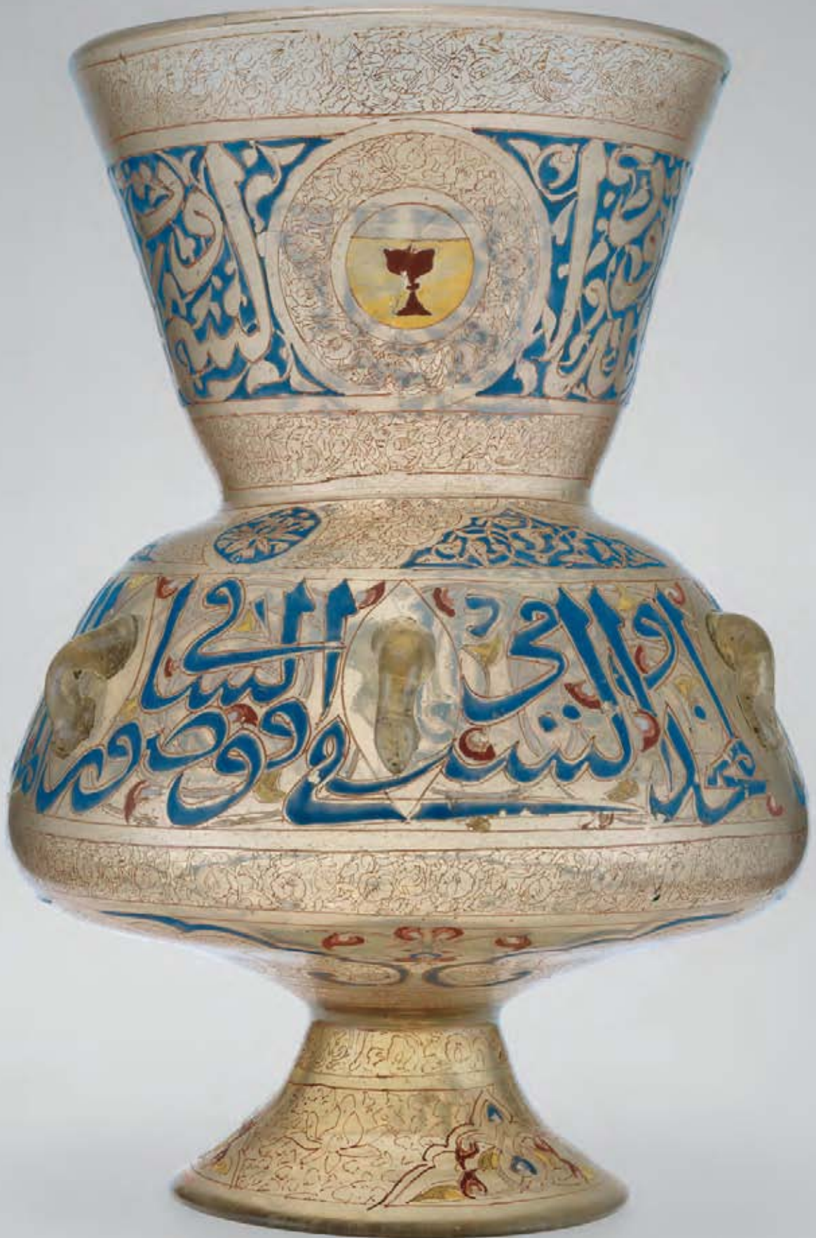
6. Mosque lamp