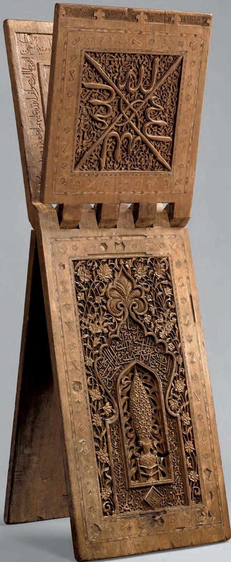
5. Qur'an stand ( rahla )