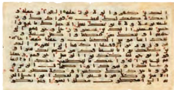
FIG. 7. Folio from a Qur'an manuscript, 9th century; probably Egypt or Iraq; ink, opaque watercolor, and gold on parchment; 1 \frac{1}{2} x 2 \frac{3}{8} in. (3.8 x 7.3 cm); Rogers Fund, 1962 (62.152.2)