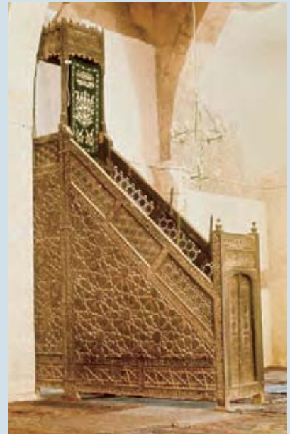
FIG. 3. Minbar in the Great Mosque of Divrigi, Divrigi, Turkey, 1228–29