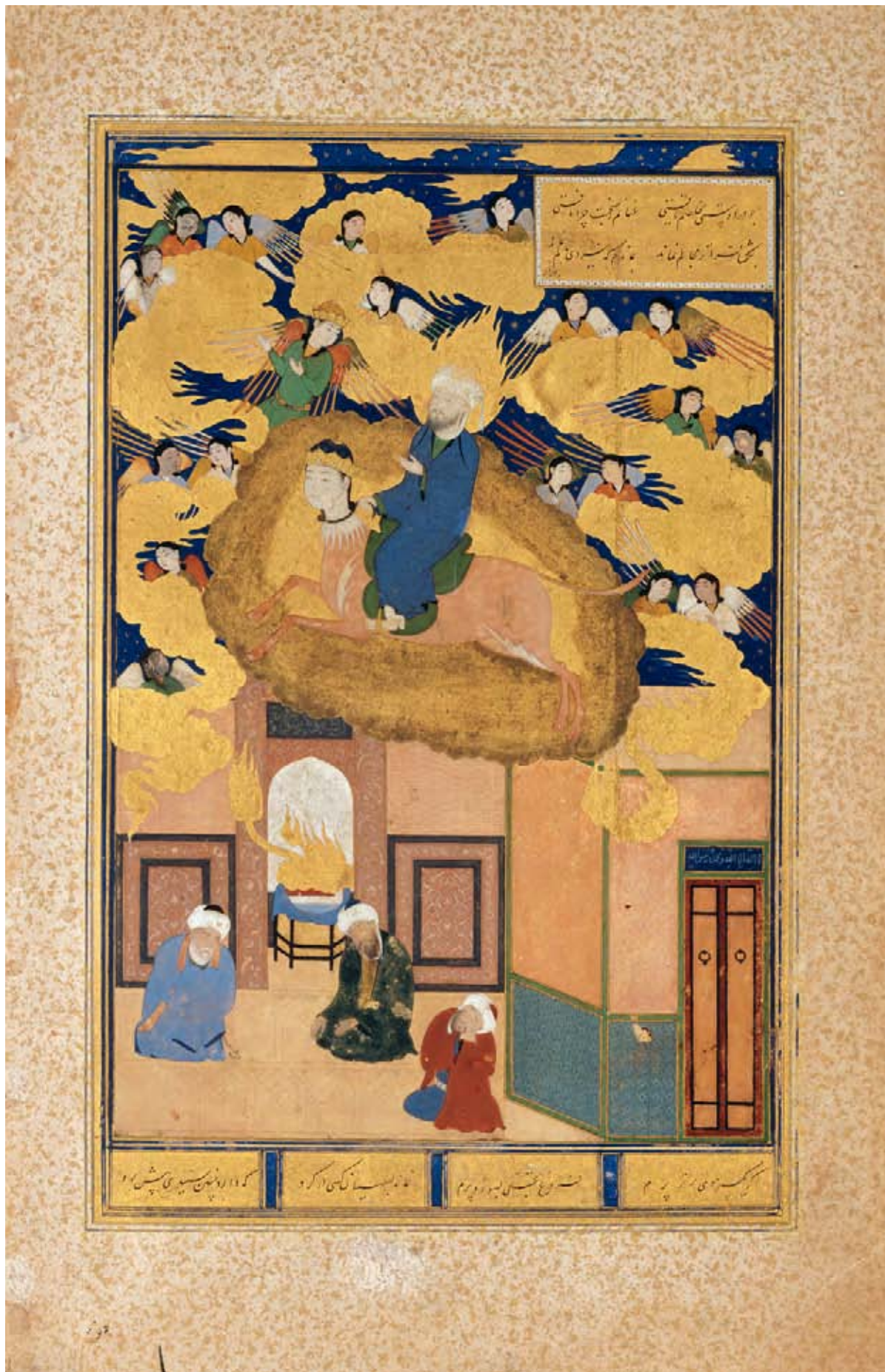
2. The Night Journey of The Prophet Muhammad ( Mi'raj ): Folio from the Bustan (Orchard) of Sa'di