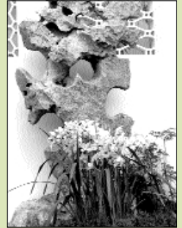
Can you find this detail in The Astor Court?

This garden was inspired by a courtyard in a scholar's garden in the city of Suzhou, near Shanghai, China. What do you think it was used for? How does it make you feel?