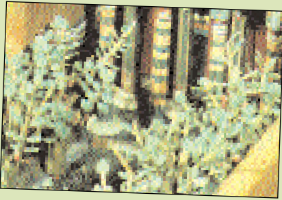
Where is this garden blooming?

2. Find this work in the Lila Acheson Wallace Galleries of Egyptian Art on the first floor. HINT: Take the corridor to the right of The Tomb of Perneb. Make a right and enter the first doorway you see.