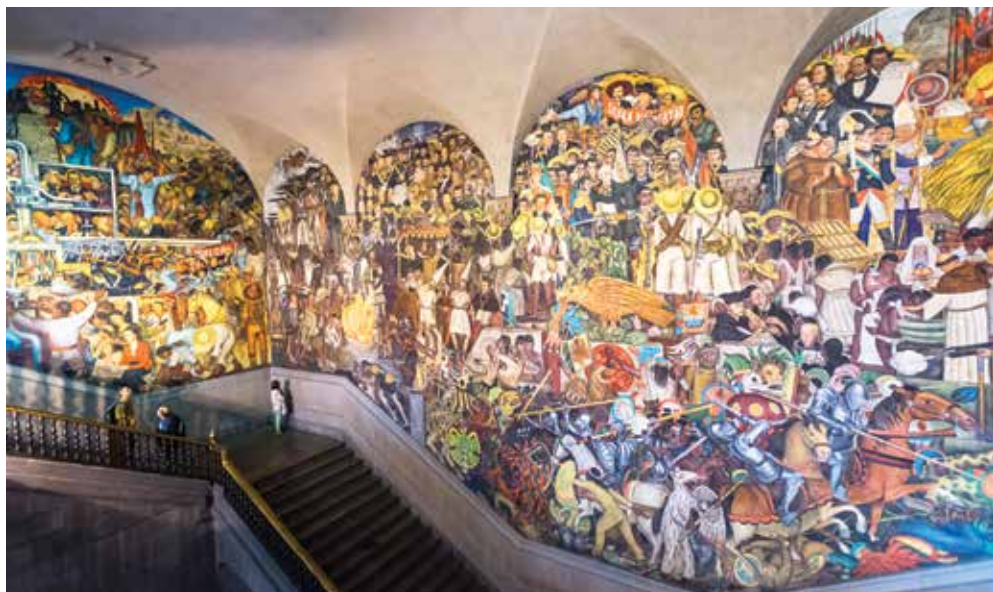
Epic of the Mexican People mural by Diego Rivera, National Palace