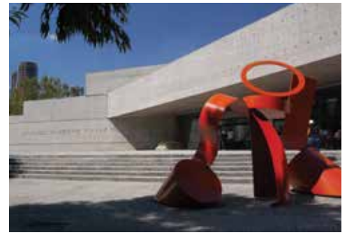
Tamayo Museum