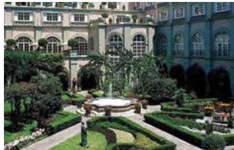
Four Seasons Hotel Mexico City lobby (top); gardens (above)