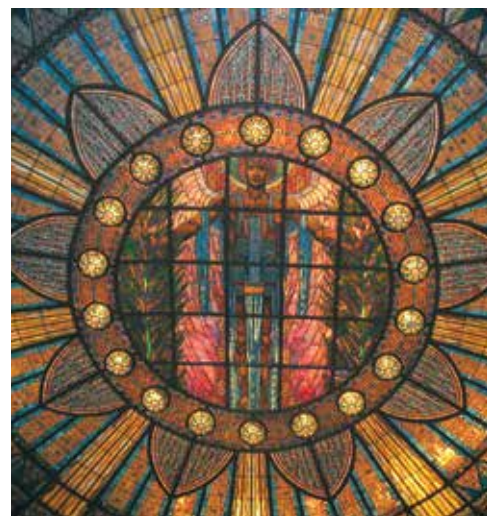
Stained glass window in Palace of Fine Arts

Begin the day with a private, before-hours tour of the Júmex Museum, the largest private contemporary art collection in Latin America, in a building designed by David Chipperfield. Continue to the Soumaya Museum, Carlos Slim's private collection of works by Rodin, B, L