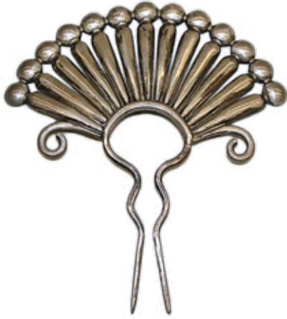
Comb, 20th century. Silver. The Metropolitan Museum of Art, Gift of Diana Vreeland, 1979 [1979.435.35]

Picasso, Matisse, and others; and the Luis Adelantado Gallery. Enjoy an afternoon at leisure before an after-hours curatorial tour of the National Museum of Anthropology, devoted to the great pre-Hispanic civilizations. Its impressive buildings and grounds were designed by Pedro Ramírez Vázquez. A special cocktail reception at the museum precedes our farewell dinner at the acclaimed Dulce Patria restaurant in the Polanco district. B, L, R, D