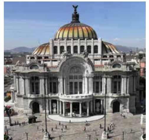
Photos clockwise from top: Dream of a Sunday Afternoon in Alameda Park (detail) by Diego Rivera, Luis Barragán House and Studio, Blue House, Palace of Fine Arts, House-Studio Museum of Diego Rivera and Frida Kahlo; Children's Games, 1959. Rufino Tamayo (Mexican, Oaxaca 1899–1991 Mexico City). Oil on canvas. The Metropolitan Museum of Art, Gift of Mr. and Mrs. Ralph F. Colin, 1983 [1983.208]; San Ildefonso College; Front cover: Soumaya Museum, Back cover: Vitral (detail), 1998. © Gabriel Orozco (Mexican, born Jalapa Enriquez, 1962). Silver dye bleach print. The Metropolitan Museum of Art, Purchase, The Judith Rothschild Foundation Gift, 1999 [1999.202.2] (top). Museum of Contemporary Art, (bottom).