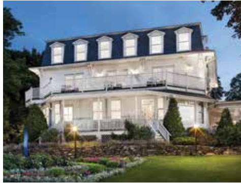
Relais & Chateaux Camden Harbour Inn, Camden

Located in a building that once housed the state's largest newspaper, The Press Hotel is full of playful newsroom references, including an art installation of antique typewriters and thought-provoking quotes found in unexpected places. Each of the hotel's 110 guest rooms and suites features a vintage-styled journalist's desk and local artwork. The historic building boasts oversized windows, providing natural light and fresh Maine air.