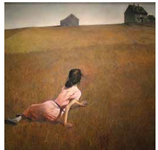
Photos clockwise from top right: regional map; Farnsworth Art Museum's Wyeth Center, Christina's World by Andrew Wyeth, Cellardoor Winery, Rockport, Maine Maritime Museum, Bath, Coastal Maine Botanical Gardens, Boothbay, Front cover: Cannon Rock, 1895. Winslow Homer (American, Boston, Massachusetts 1836–1910 Prouts Neck, Maine). Oil on canvas. The Metropolitan Museum of Art, Gift of George A. Hearn, 1906 [06.1281]. Back cover: Celia Thaxter's Garden, Isles of Shoals, Maine, 1890. Childe Hassam (American, Dorchester, Massachusetts 1859–1935 East Hampton, New York). Oil on canvas. The Metropolitan Museum of Art, Anonymous Gift, 1994 [1994.567] (top); Camden, (bottom).