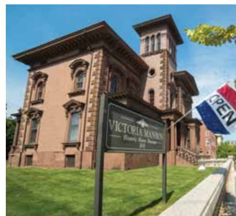
Morse-Libby House

This itinerary is subject to change at the discretion of The Metropolitan Museum of Art and Arrangements Abroad. For complete details, please carefully read the terms and conditions at www.arrangementsabroad.com/terms .