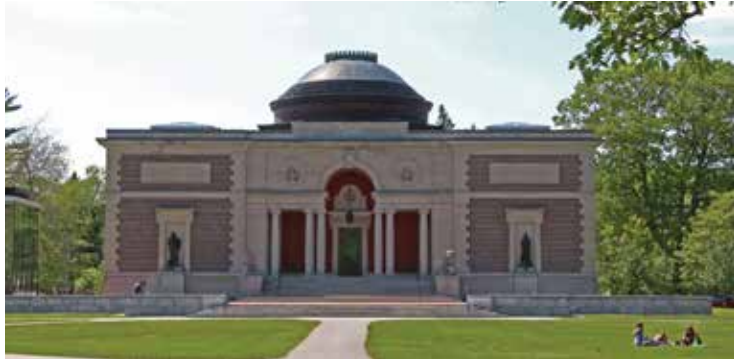
Museum of Art, Bowdoin College