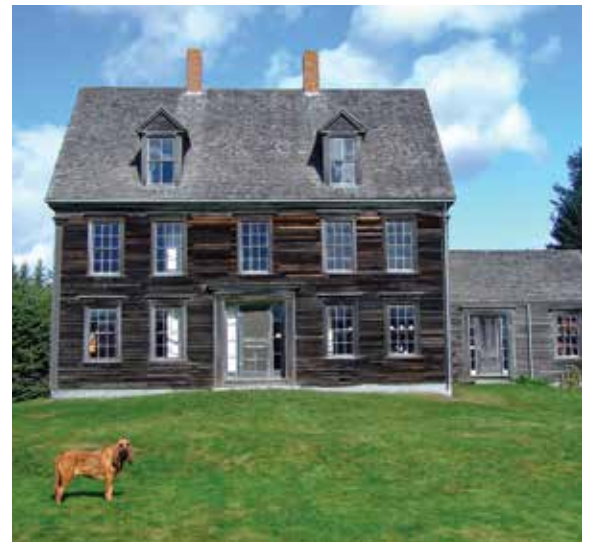
Olsen House