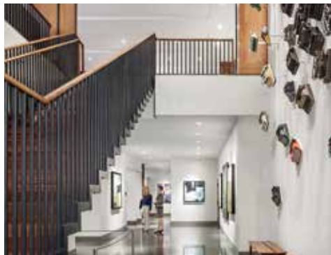
The Press Hotel, Portland