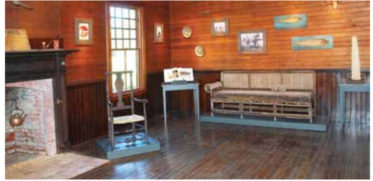
Winslow Homer's studio, Prouts Neck