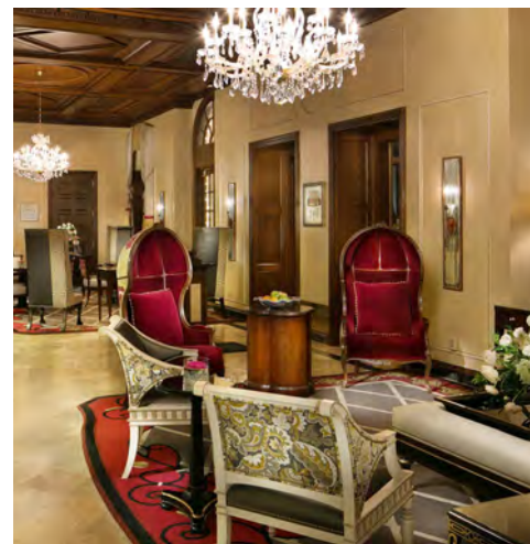
Raphael Hotel, Kansas City

Located in Bentonville town square and a short walk to Crystal Bridges Museum of American Art, 21c Museum Hotel, Bentonville is a 104-room boutique hotel, contemporary art museum, cultural civic center, and home to The Hive restaurant.