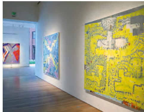
Nerman Museum of Contemporary Art, Kansas City

Begin the day with a curatorial visit to the Nelson-Atkins Museum of Art. There will also be time for individual touring at the Museum before lunch in the cafe. This afternoon, explore the Nerman Museum of Contemporary Art, known for its collection of emerging and established artists, followed by a visit to a gallery or private collection. Dinner is at leisure. B, L, R