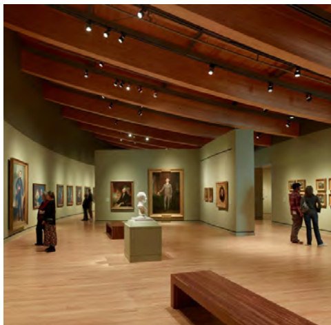
Crystal Bridges Museum, Bentonville, photo courtesy of Arkansas Dept of Parks and Tourism (top) and Colonial to early 19th century art gallery by Timothy Hursley, courtesy of Crystal Bridges Museum (above)