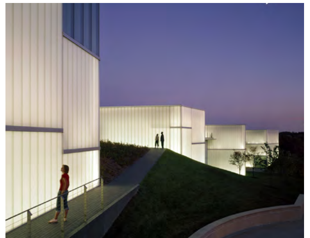
Bloch building, Nelson-Atkins Museum