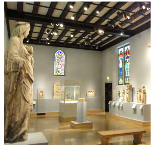
Medieval gallery, Nelson-Atkins Museum, Kansas City, photo courtesy of the Nelson-Atkins Museum

This itinerary is subject to change at the discretion of The Metropolitan Museum of Art and Arrangements Abroad. For complete details, please carefully read the terms and conditions at www.arrangementsabroad.com/terms .