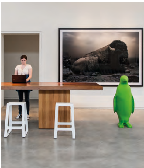
21c Museum Hotel, Bentonville