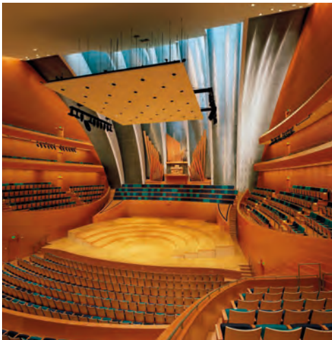
Kauffman Center for the Performing Arts, Kansas City

Depart on a morning excursion to the Harry S. Truman Library and Museum, the final resting place of the 33rd President of the United States. At Webster House, a restored Romanesque-style school, enjoy a tour and lunch. In the afternoon, visit the Kauffman Center for the Performing Arts. This facility was designed by Moshe Safdie, who was also the architect of Crystal Bridges. B, L, D