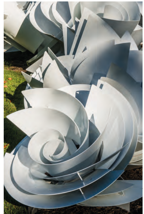
Photos clockwise from top right: Nelson-Atkins Museum at night, Kansas City, courtesy of Visit KC; Harry S. Truman Library, Kansas City, photo courtesy of the Truman Library; Installation at Crystal Bridges Museum, Bentonville, courtesy of Arkansas Parks; Thomas Hart Benton House interior, Kansas City, photo courtesy of Missouri Parks; downtown Bentonville; Nelson-Atkins Museum, Kansas City, courtesy of Missouri Tourism. Front cover: Nelson-Atkins Museum, Kansas City, courtesy of Missouri Tourism. Back cover: Kauffman Center for the Performing Arts, Kansas City, courtesy of Missouri Tourism (top); Crystal Bridges Museum, Bentonville (bottom).