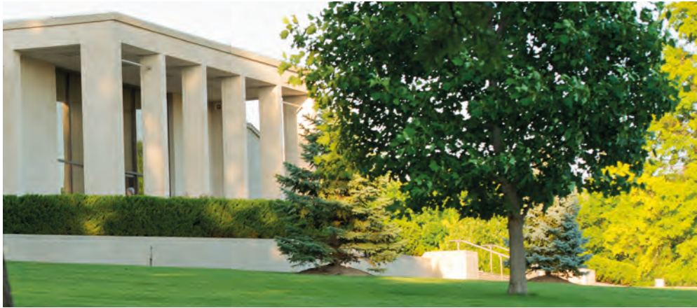
Harry S. Truman Library and Museum, Kansas City