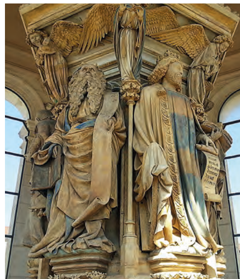
Well of Moses, Chartreuse de Champmol, Dijon

Drive to Lyon to discover highlights of its Musée des Beaux-Arts and visit the Cathedral of Saint John the Baptist, completed in 1476, with its famous Astronomical Clock. During lunch at a Michelin-star restaurant, the chef will take us behind the scenes in his kitchen. This afternoon explore the Gallo-Roman Museum on the hillside overlooking the city before checking in at our hotel. B, L