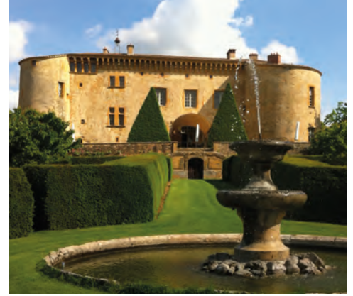
Château de Bagnols, Bagnols