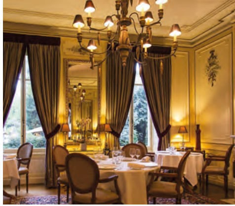
Hostellerie le Cèdre, Beaune

Explore the Halles Paul Bocuse market on a morning visit in the company of a chef. We will see the produce transformed for our dinner this evening. Then take an architectural walking tour of the revitalized Lyon Confluence district, featuring an impressive new museum. Lunch and the afternoon are free to enjoy the city on your own. This evening celebrate our trip with a lively farewell dinner at a traditional Lyonnais bouchon . B, D