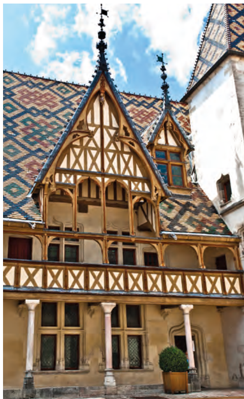
The Hospices de Beaune