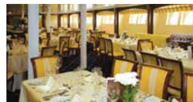
Volga Dream Owner's Suite (left), dining room (right)

The finest riverboat in Russia is celebrated for her elegant appointments, meticulous design, and impeccable service. All 56 staterooms have river views, marble-accented private bathrooms, air conditioning, telephones, flat-screen satellite TVs, a room safe, and plush bathrobes. Complimentary wine is offered at lunch and dinner, which showcase Continental cuisine alongside Russian specialties. The lounge, decorated with paintings by contemporary Russian artists, offers panoramic views, live music, and Wi-Fi. The full-length sun deck, featuring teak planking and deck chairs, is a lovely setting for al fresco dining, and other amenities include a fitness room, hair salon, massage room, and sauna. A physician accompanies each cruise.