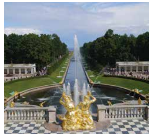
Peterhof Museum, St. Petersburg, photo by Noorul Farha As'art

The itinerary is subject to change at the discretion of The Metropolitan Museum of Art and Arrangements Abroad. For complete details, please carefully read the Terms & Conditions at www.arrangementsabroad.com/terms