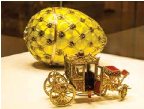
Fabergé Museum, St. Petersburg

An optional three-night prelude in Moscow is offered from June 5-9.