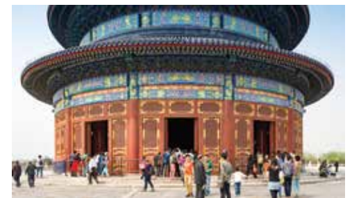
Temple of Heaven, Beijing