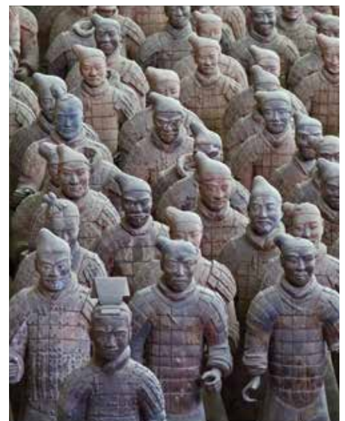
Photos clockwise from top right: Mogao Caves, Dunhuang; Master of the Fishing Nets Garden, Suzhou; Terra-Cotta Warriors Museum; Suzhou Museum; Forbidden City; regional map. Front cover: Eight Landscapes , 1699. Lu Han (Chinese, died 1722). Album of eight leaves; ink and color on paper. The Metropolitan Museum of Art, Gift of Mrs. Henry J. Bernheim, 1945 [45.97.9]. Back cover: Portrait of Ren'an in a Landscape , dated 1684. Shitao (Zhu Ruoji) (Chinese, 1642–1707) and Zhang Ziwei (Chinese, active late 17th century). Handscroll; ink and color on paper. The Metropolitan Museum of Art, Purchase, The Dillon Fund Gift, 1987 [1987.149] (top); Shanghai (bottom).