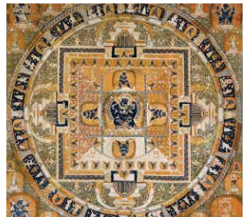
Vajrabhairava Mandala , ca. 1330–32. Silk tapestry (kesi). The Metropolitan Museum of Art, Purchase, Lila Acheson Wallace Gift, 1992 [1992.54].