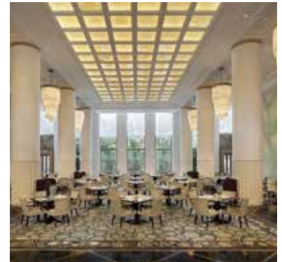
Peninsula Hotel, Shanghai

Situated along the historic Bund riverfront.