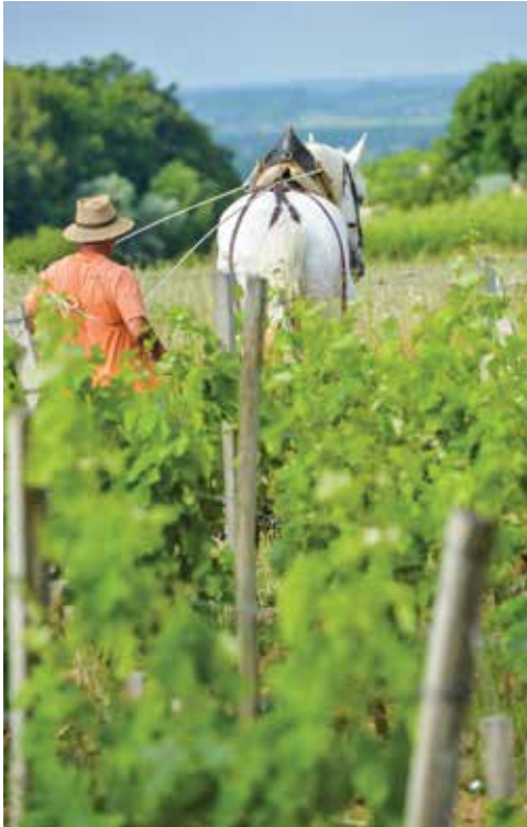
Vineyard at Saint-Émilion