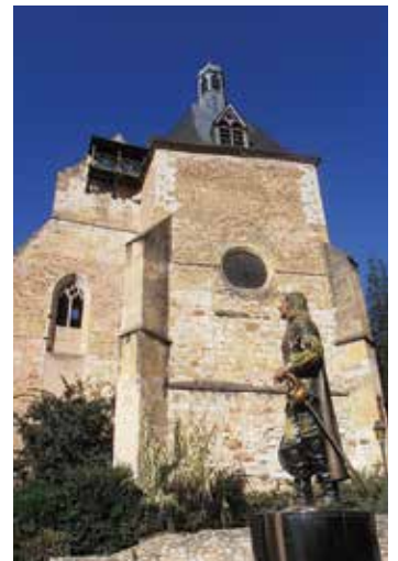
St. Jacques' Church