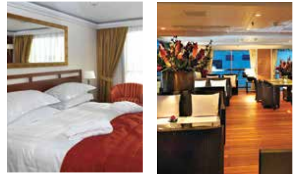
Stateroom on Violin Deck (left); lounge (right)

Cruise Europe's scenic waterways aboard the elegant M.S. AmaDolce , christened in 2009. All accommodations face outside, and most have large French balconies. Relax in the lounge and experience fine international cuisine in the dining room or Chef's Table restaurant. The ship also features an elevator, whirlpool, wellness area, and bicycles for guests to use ashore. All cabins and suites have air conditioning and an entertainment system with television and Internet access.