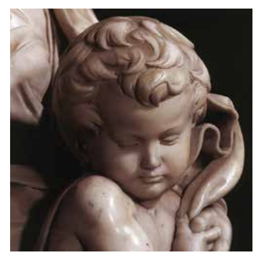
Madonna and Child detail, by Michelangelo, Bruges

-Enjoy an onboard concert of chamber music, performed by an exciting quartet