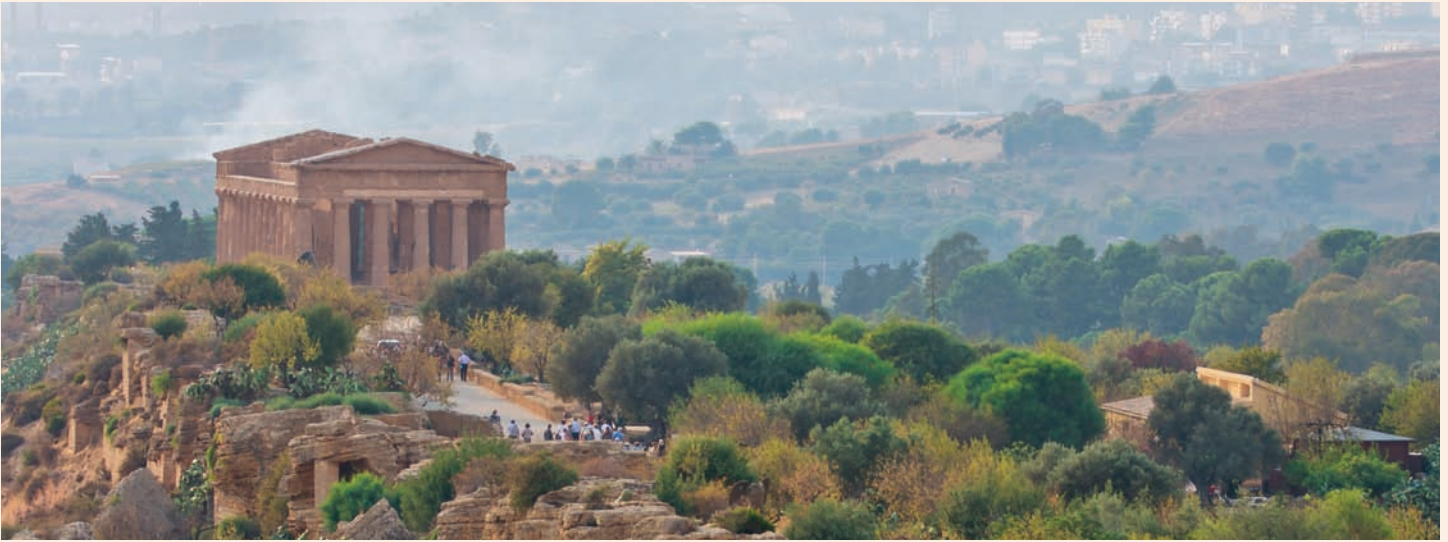
Valley of the Temples, Agrigento