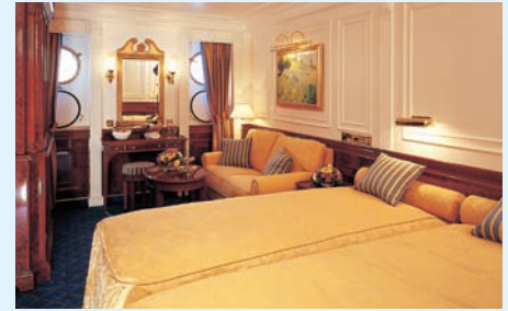
Owner's Suite (top), a Deluxe Cabin on Cabin Deck (above)