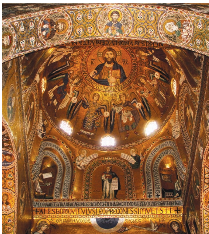
Palatine Chapel, Palace of the Norman Kings, Palermo

Early this morning we sail through the Aeolian archipelago, volcanic islands off the north coast of Sicily. Tender ashore to Lipari, which has known uninterrupted occupation since the Neolithic Age. The Archaeological Museum within the fortress walls has a superb collection of artifacts, including extraordinary masks from this and nearby islands.