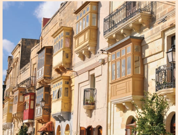
Historic balconies, Valletta

OPTIONAL MALTA POSTLUDE $1,395 per person. Single supplement $295. Includes two nights at the Phoenicia Hotel; breakfast daily, one lunch, and one dinner; sightseeing as noted.