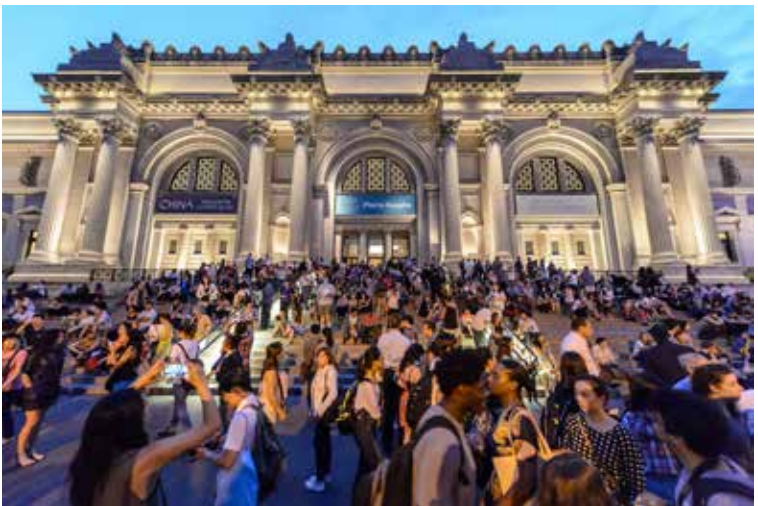
Right

How do artists break through barriers of communication? Join us for artist talks, art making, and a panel discussion exploring symbolism, language, and other ways to build understanding. FRI JUL 28, 5–9 PM